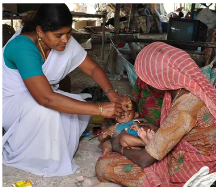
National Immunisation Day helps widen coverage and reach underserved communities